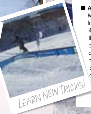
LEARN NEW TRICKS!

PIC: SNOWBOARD COACH PETE LONG HITTING THE BACKCOUNTRY BOOTER